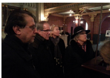
Inside the Jewish Tempel Synagogue of Krakow

3) It has been decided that under the leadership of ECI there will be a commemoration concert in the Jewish Tempel Synagogue of Krakow on January 27, 2015. GPC-conference participants are invited to the concert free of charge. We trust that we will also have representatives from Israeli, Polish, German and other nations with national governmental profile. The president of the synagogue is very open, supportive and grateful for that initiative.