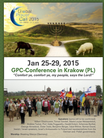
GPC-conference in Krakow