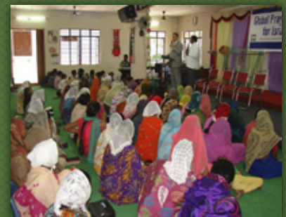
Pastors-conference in India